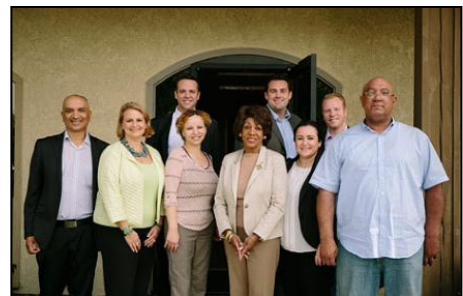
In 2014, the TACC advocated for the renewal of the Ex-Im Bank and hosted Congresswoman Maxine Waters and several local manufacturers to increase advocacy for the bank's renewal

The high-tech industry has been established in the Torrance area for a number of years and the TACC supports continued production and employment by