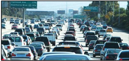
With an increase in fuel-efficient vehicles and the sunset of Prop 1B, California is in a transportation crisis

Policy Objective: Improve decaying infrastructure to connect the Torrance area to its region