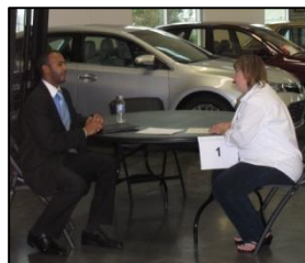
iVet helps employers efficiently access the Veteran workforce