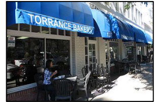
The TACC supports policies that invest in effective advertising strategies that leverage the area’s attractions such as: Torrance Beach and the city’s historic Downtown area

Discussion: The TACC supports policies that will effectively increase travel to and within the state to stimulate economic growth and job creation. We believe effective marketing campaigns and strategies need to be invested in. The TACC supports the Torrance Tourism Business Improvement District (TTBID) and supports Discover Torrance as the private nonprofit organization to administer the TTBID’s activities and improvements to attract visitors to the area. The TACC supports local policies that will effectively move tourists to prominent destinations throughout the city and strategically advertise the city’s unique attractions such as: the Del Amo Fashion Center, the historic Downtown area, and Torrance Beach.