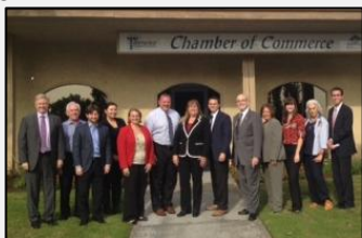
2015 TACC GAP group

The Torrance Area Chamber of Commerce (TACC) is an aggressive advocate for the interests of the area's business community. The TACC seeks to influence policy decisions across all levels of government in order to gain and maintain a pro-business environment.