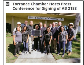
The TACC promotes policies that increase jobs and environmental quality

Policy Objective: California provides affordable water and energy reliability, and encourages economic growth through pro-jobs environmental policies.